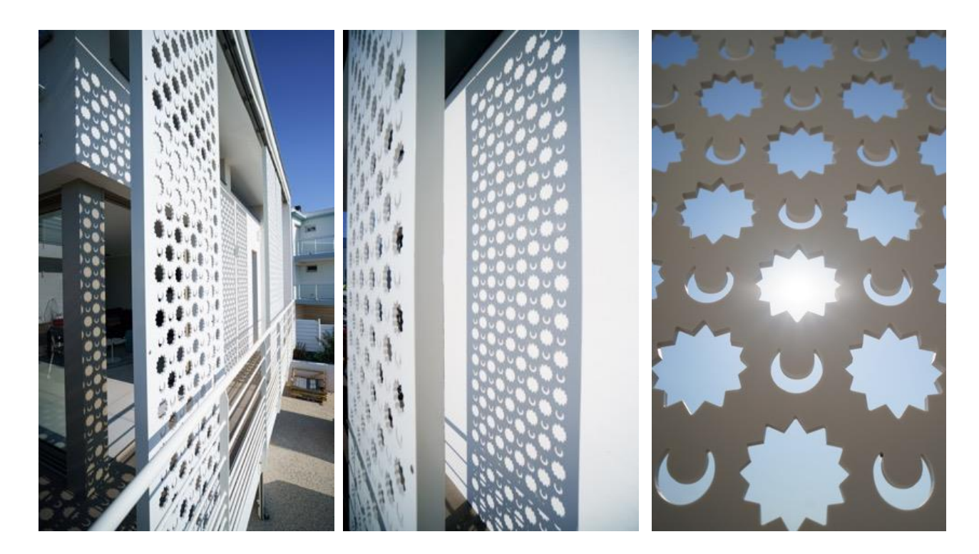
Another nod to 1950s Royan: Slatted shutters

"More than just a source of inspiration, a real synthesis was established between our creative process and the HI-MACS® material. For people like us, who love light and uncompromising finishes, that material allows us to express ourselves freely, by working it in rather unconventional ways. The most stimulating part for us was that HI-MACS® is able to wonderfully convey all of the sensitivity and emotions that we put into our work." enthuses Julien.