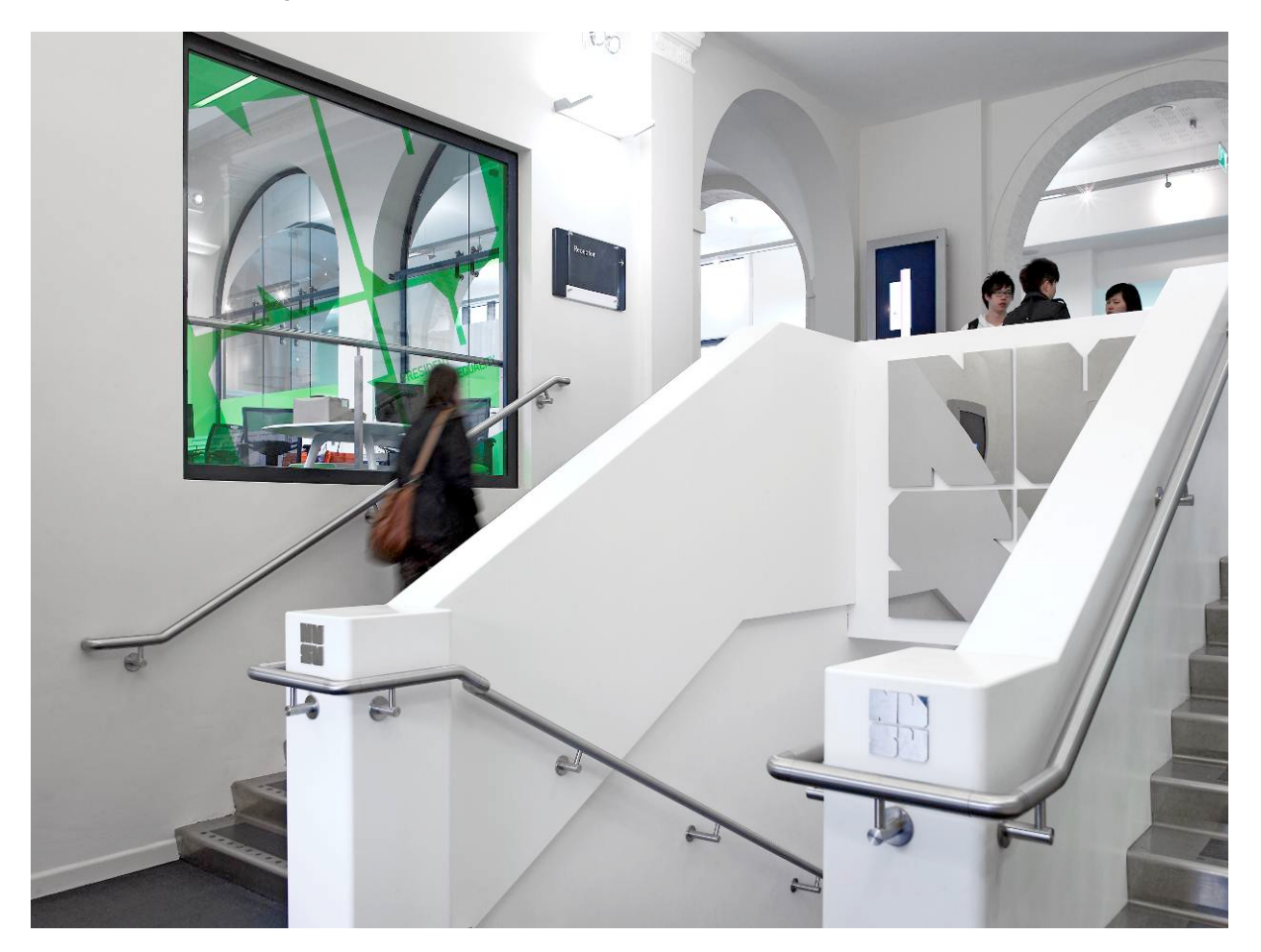
Stairs cladding view, Photo: Cadzow Pelosi

therefore the integral structure and fabric had to remain intact so, for instance, the cladding of the main staircase was only allowed if it retained the original feature. HI-MACS® was used as the ideal cladding choice.