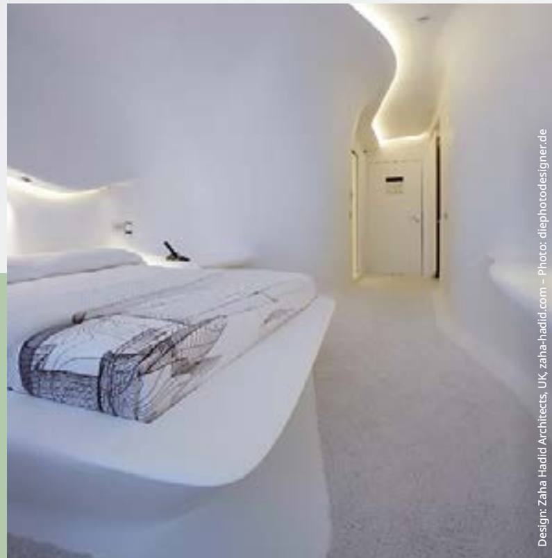
Design: Zaha Hadid Architects, UK, zaha-hadid.com