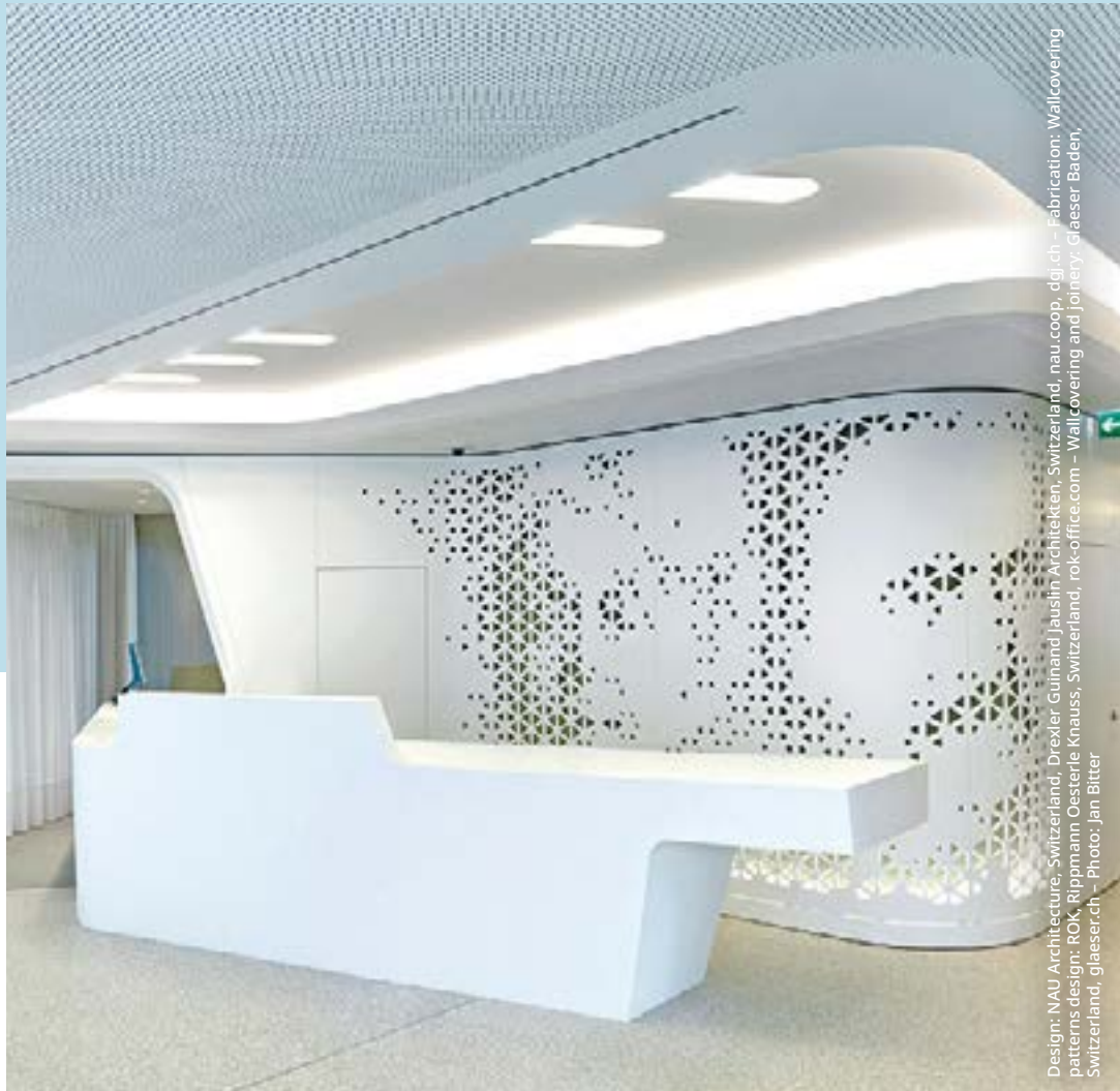
This counter in a bank in Zurich conveys respectability. And through the milled heads of the founders, also half of the company history. Perfect!