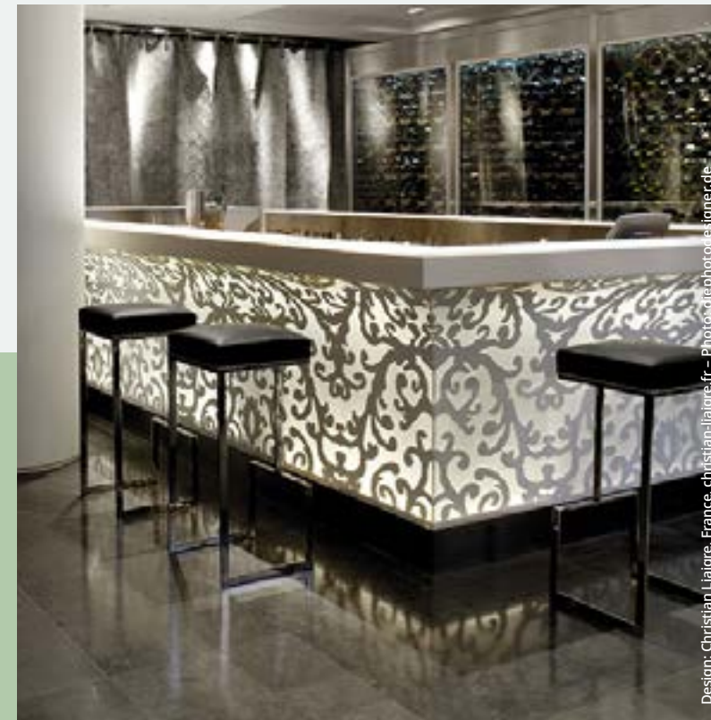
Design: Christian Liaigre, France, christian-liaigre.fr - Photo: diephotodesigner.de