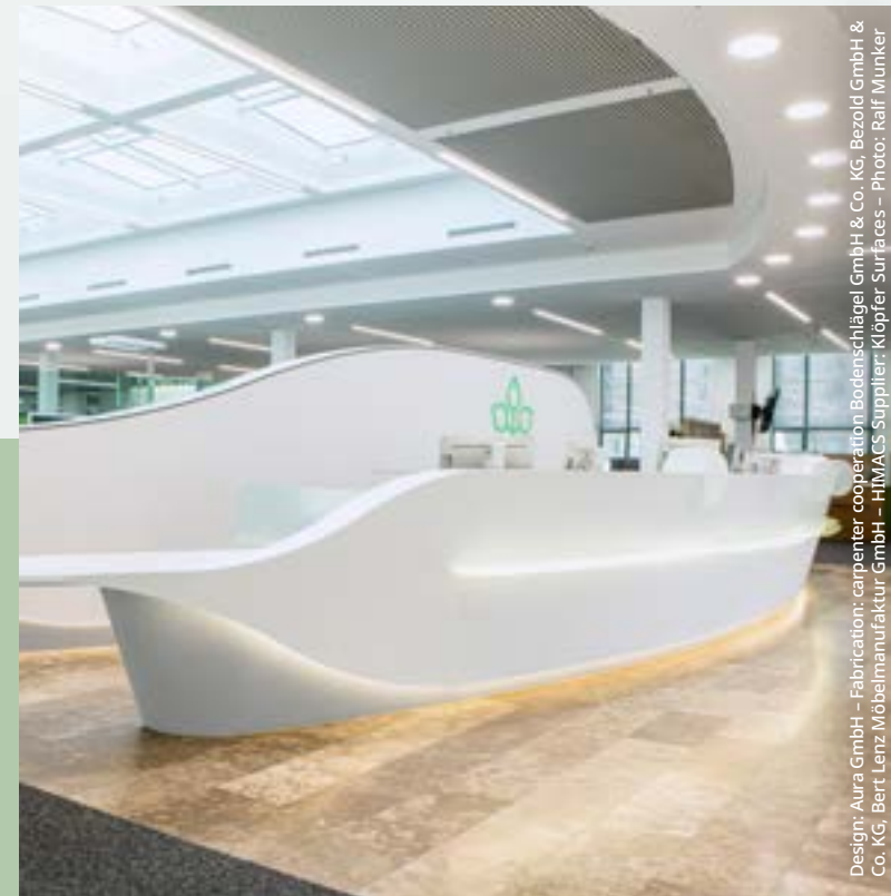
Design: Aura GmbH - Fabrication: carpenter cooperation Bodenschlägel GmbH & Co. KG, Bezold GmbH & Co. KG, Bert Lenz Möbelmanufaktur GmbH - HIMACS Supplier: Klopfer Surfaces