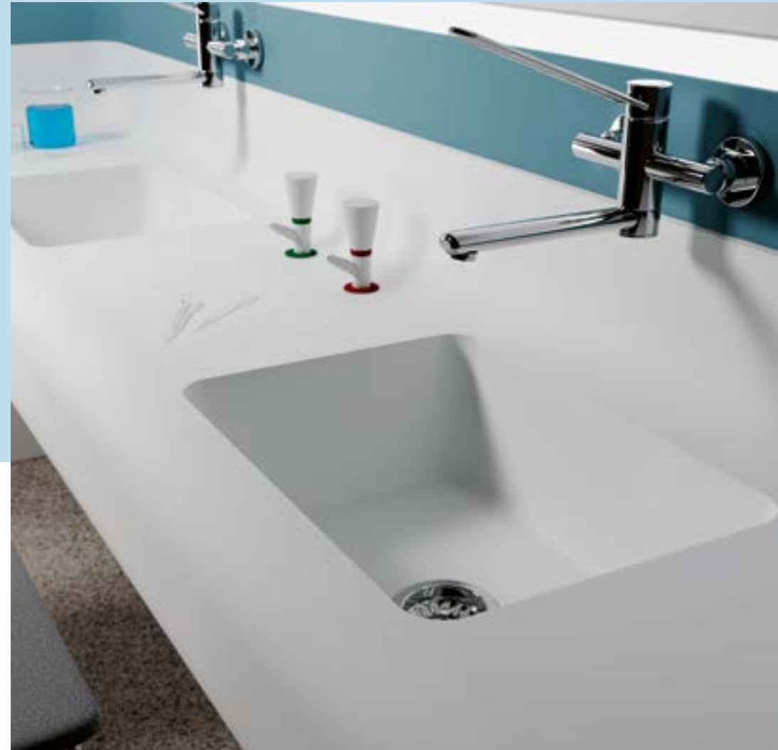
In hospitals, what counts above all is maximum hygiene. And if the seamlessly integrated super-spacious basins also look good, all the better.