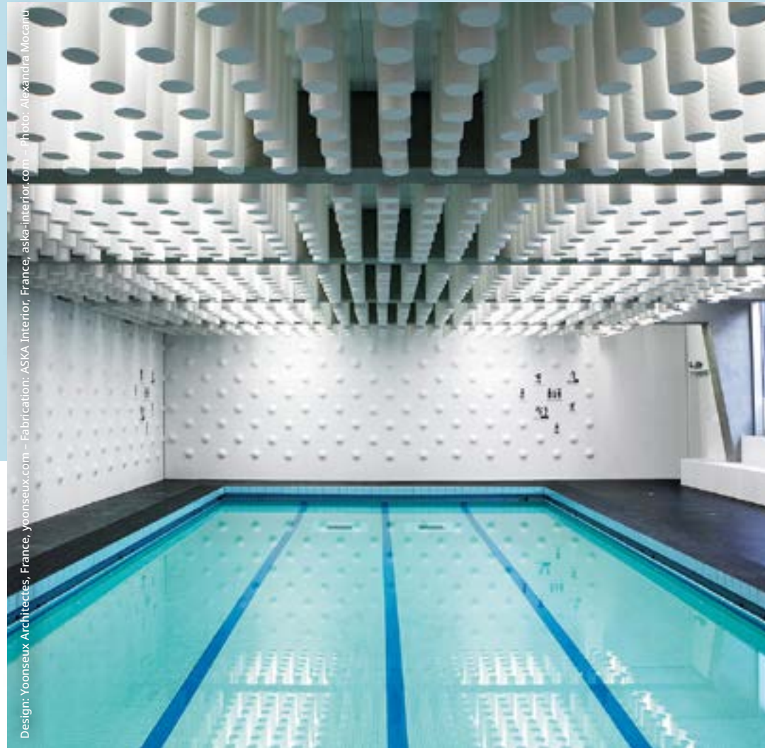
Thermoformed wall-claddings in one of Paris' coolest indoor pools.